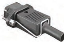
Retainer clip (included)