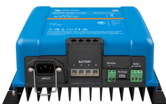
Phoenix Smart 12/50(3)